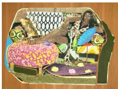
Mickalene Thomas, You're Gonna Give Me the Love I Need , 2010; Published by the Brodsky Center for Innovative Editions

Benefit Print Project is pleased to announce the launch of its quarterly newsletter and newly designed